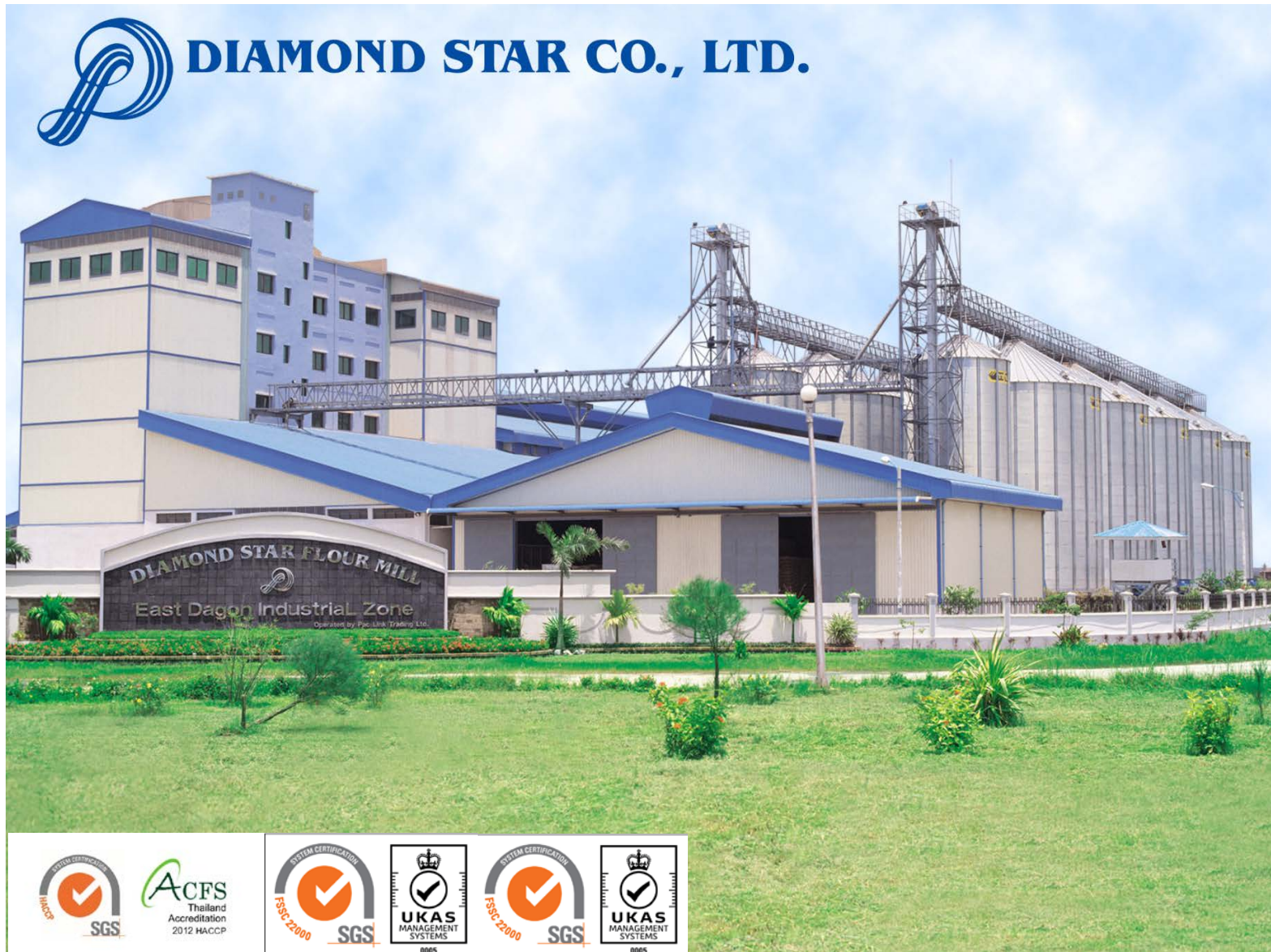
Yangon Flour Mill is located on No(50-52)Kanaung Minthargyi road, East Dagon Industrial Zone