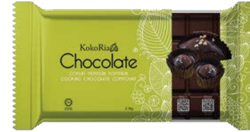
KokoRia Chocolate Compound