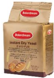
Instant Dry Yeast