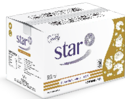
Butter Oil Substitute