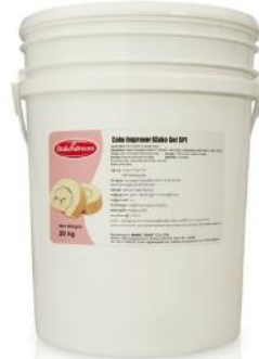
Cake Improver (SP)