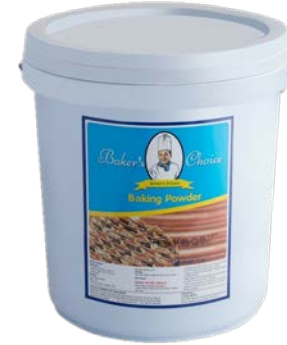
Baker's Choice Baking Powder