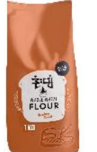
Rocket Whole Wheat