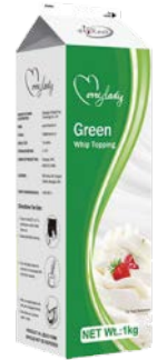
Merry Lady Whip Topping Cream