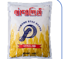
Diamond Star Semolina