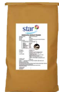
Desiccated Coconut Powder